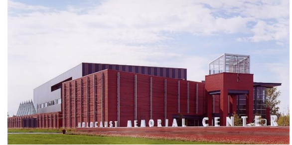
Holocaust Memorial Center