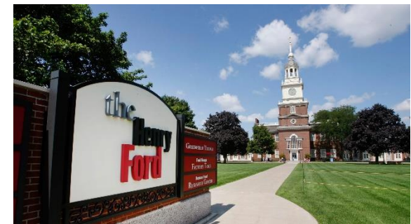
Henry Ford Museum