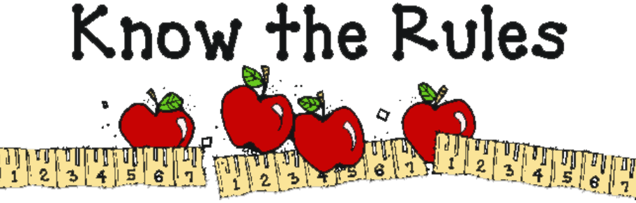
Helpful Information that you should know about Anchor Bay Early Childhood Preschool Programs