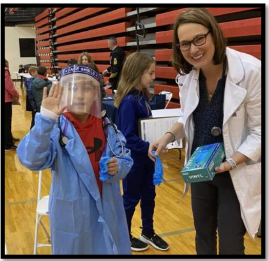
Students could ask questions, but also got a hands-on experience with some of the equipment used in various fields.

Students had a worksheet and were asked to learn about three different career fields during their visit. Most students spoke to a lot more than the assignment asked for! Not only did our students enjoy the Career Fair, the vendors also talked about how great it was to have this opportunity to share with students. They were impressed by the awesome questions our kids asked. One cool fact about the event, most of the adults who came to the Career Fair were either Anchor Bay alumni or have kids in our district. We are a district that keeps on giving back to our kids!!