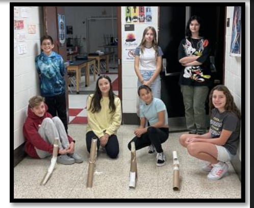
The first building challenge as a class was to see who could design the best marble run for distance.

The class at South started out with classroom projects to get students familiar with the resources. Students learned how to use the cutting edge classroom tools such as 3D Printers, Glowforge Laser Printers, Raspberry Pi Programming equipment, and standard tools like drills and glue guns. After the first quarter, students were set free to design and create their own projects. Students had to create prototypes with cardboard and have teacher approval to go forward. Students were not limited to the classroom tools and could create whatever they wanted... the only catch, they had to figure out how to make their projects and not rely on a teacher to take them through it step-by-step.