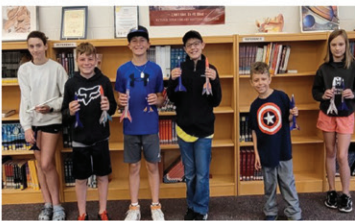
Airplanes and Rockets