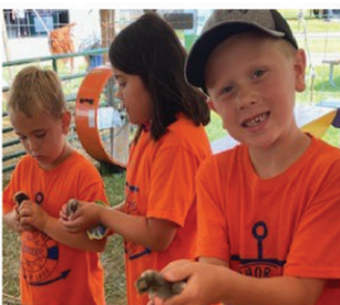
Saint Clair County 4-H Fair