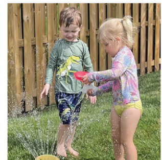
Water Fun at ECC

Kids also enjoyed new supplies from the 2022 Summer Childcare Stabilization Grant that included outdoor toys, craft supplies and more!