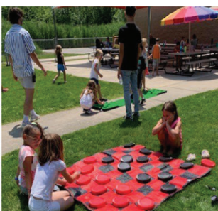
Outdoor Games & Activities