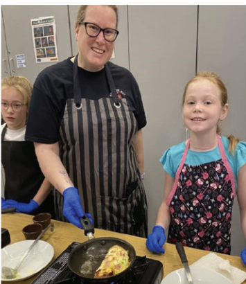
Egg Week - Cooking Class