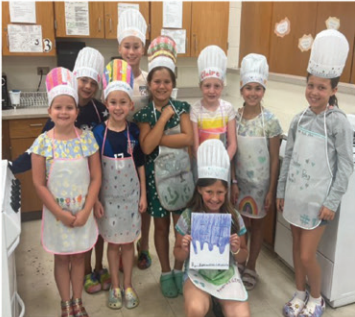
Kids Cooking Classes