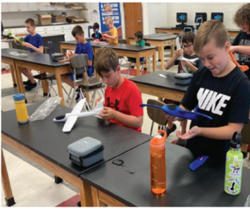
Aerodynamics and Drone Flying