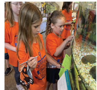
Lake St Clair Metro Park Nature Center